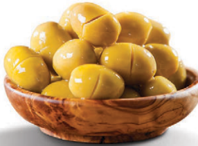
Cracked Green Olives