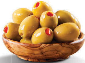
Stuffed Green Olives