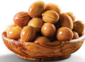
Scratched Green Olives