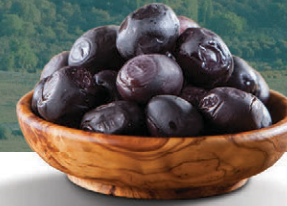
Low Salted Black Olives