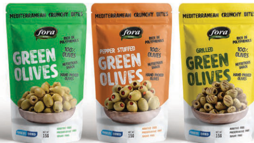
Freeze Dry Olives